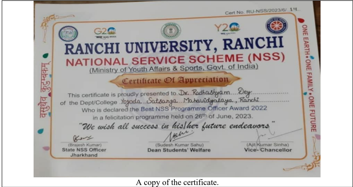
A copy of the certificate.