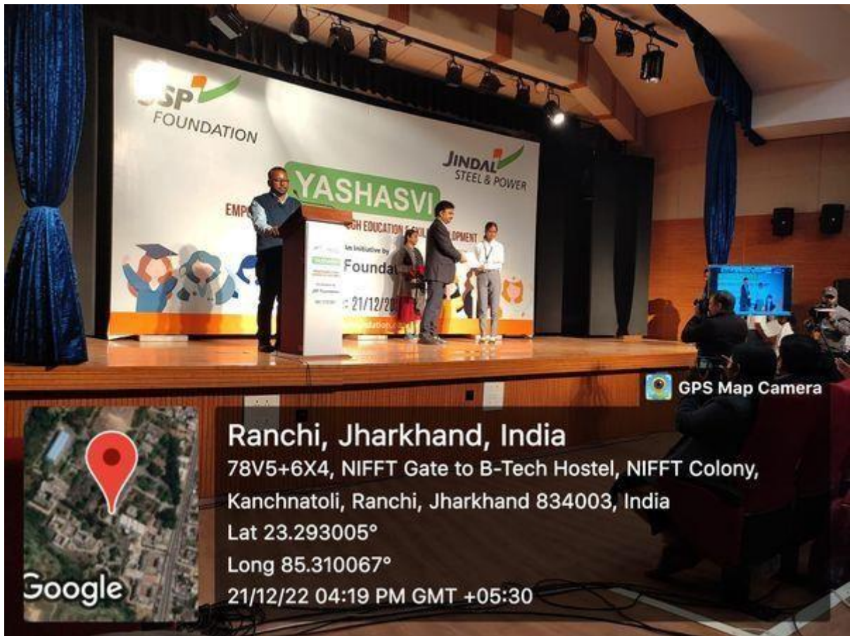
Picture of the scholarship letter distribution program organised by JSP Foundation