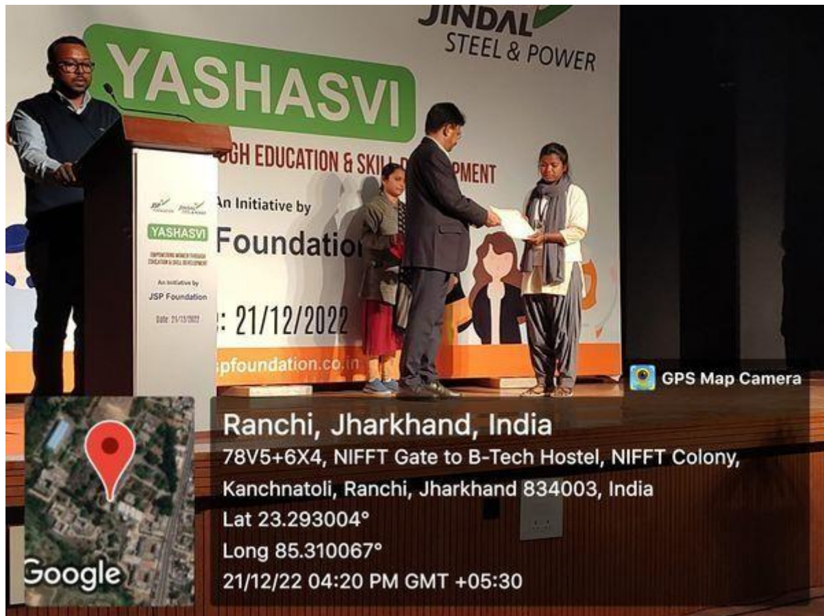
Picture of the scholarship letter distribution program organised by JSP Foundation.