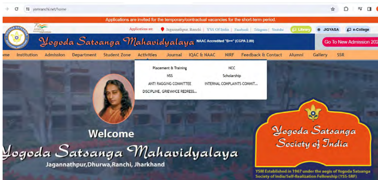
College website showing different committees

Moreover, our college proactively incorporates and enforces UGC notifications as they are issued periodically. In congruence with the UGC's directives, specifically outlined in the notification CG-DL-E-11042023-245095 dated April 11, 2023, we have also established a dedicated Student Grievance Redressal Committee . This committee is tasked with overseeing the resolution of student grievances in alignment with the principles of fairness and transparency prescribed by the UGC. These committees play a crucial role in ensuring a safe campus environment.